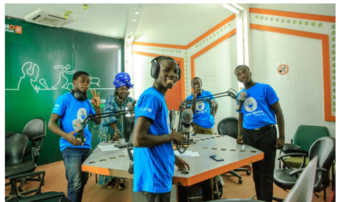
For World Children’s Day, young reporters took control of Radio Côte d’Ivoire in Abidjan. They participated in the journalist’s writing conference where they made suggestions for the sake of the child and went live from the radio to get a message across.

“I come from the tea gardens of Darjeeling. My father is the sole bread earner and he makes around Rs. 100/- per day. It is very difficult to manage the daily needs of the family. My mother has suffered from tuberculosis for the last 6 years. She has been in the hospital since then so I have to look after my sister and my studies too. I was introduced to an NGO called Anugalya who run the Children’s Parliament program. After joining my capacity of thinking increased and my thought process changed and I convinced myself to work for other children. Through my work I collected money for a child’s cancer treatment. Now I am elected as the Finance Minister of the regional children’s parliament. I want a happy, safe and healthy life for all children in India.”